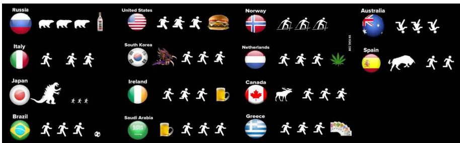
Figure 1. Stereotypes of various nationalities. “All around the world,” retrieved from http://9gag.com/gag/4028251 .

In a piece entitled “All around the world,” stereotypes of various nationalities are portrayed (see Figure 1). Set within the context of a website that has the world as its target audience, this piece reinforces the stereotypes of different nationalities. Note that although 9gag.com has users from around the world, this website is still based in the United States. The dominant worldview, therefore, is largely American, including “fat American” jokes wherein Americans make fun of themselves, while, also from the commonsense American point-of-view, making fun of other nationalities. Users from other nationalities engage with this common ground to ease into the vibe of the website. Through this piece the said stereotypes are affirmed, whether or not they are true from the perspective of the actual referents.