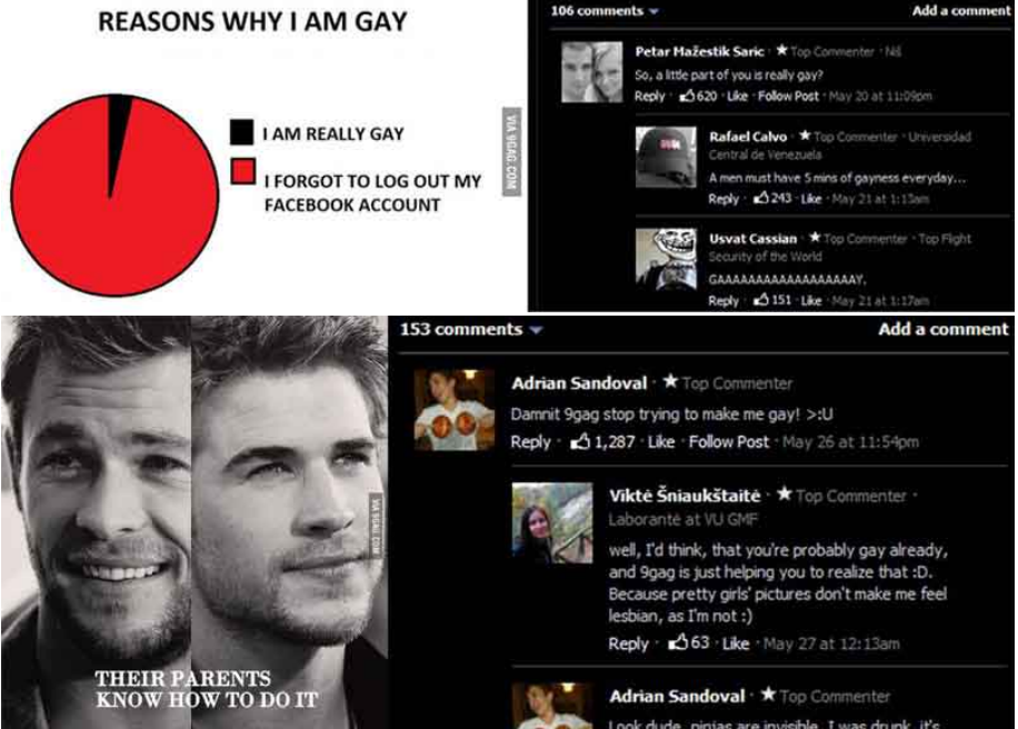
Figure 4. On gays. “Every Freakiiiiii Time” (top) ; and “No doubt that they know” (bottom) .

are exhibited in Figure 5. “We are MUSLIMS...” presents a fair perspective, something that is somewhat lacking in mainstream media. “The TV shows you what they want” promotes media literacy—a critical stance in experiencing the ubiquitous multimedia. “Girls...,” by juxtaposing Mulan with other Disney princesses, directly opposes the traditional characterization of girls as weak and subservient to men. “History is repeating itself” invokes the viewers to look at the bigger picture in the fight for right to marry. Finally, “10 Reasons to Ban Gay Marriage” uses sarcasm to reinforce the freeing of discourse on gay marriage, as illustrated in the following: “[...] 2: Gay marriage will encourage people to be gay, in the same way that hanging around tall people will make you tall. [...] 7: Obviously, gay parents will raise gay children, since straight parents only raise straight children. [...] 8: Gay marriage is not supported by religion. In a theocracy like ours, the values of one religion are imposed on the entire country. That’s why we have only one religion in America. [...] 9: Children can never succeed without a male and a female role model at home. That’s why we as a society expressly forbid single parents to raise children. ”