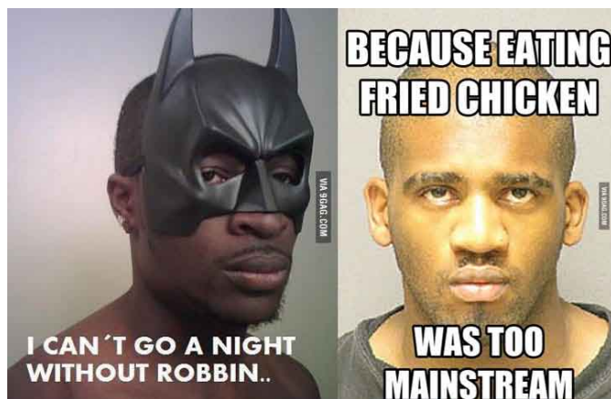
Figure 3. On race. “Robbin’ every night!” (left) ; and “I eat people...” (right).

Race is another form of othering. As in gender, discourse on race is critical since stereotyping can lead to prejudice, which, then can lead to discrimination.